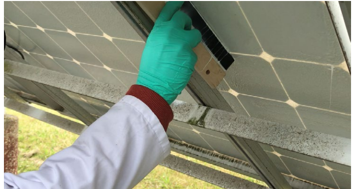
Smoothing the layer