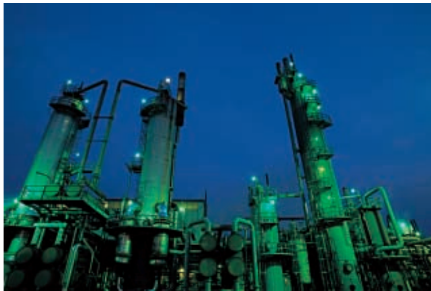
Gas treating plants use isopropanolamines for acid gas scrubbing operations.