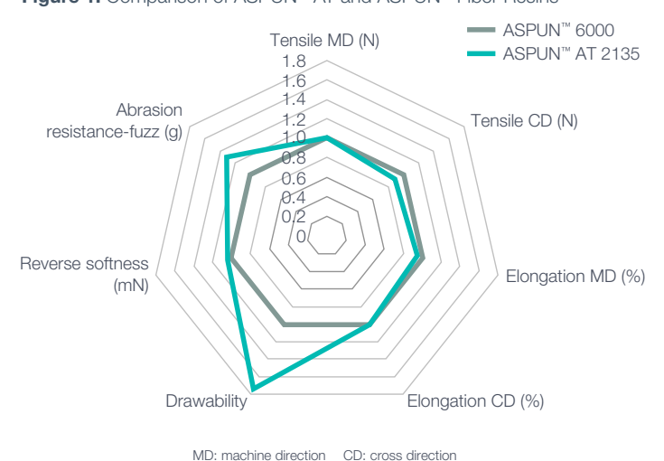
Figure 1: Comparison of ASPUN™ AT and ASPUN™ Fiber Resins(1,2)

(1) Typical values, not to be construed as specifications. Users should confirm results by their own tests. (2) Basic sample weight: 20 gsm (grams per square meter)